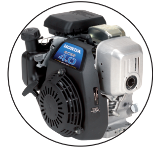
Honda GC135QHE Engine