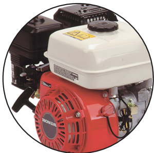
Honda GX160 Engine

For longevity the Delta is powered by an ultra reliable Honda engine, fitted with a 2:1 gearbox & 1450 Rpm Interpump plunger pump - an outstanding combination of high performance & reliability.